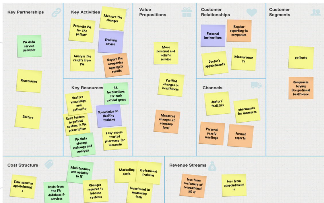
Figure 2: Business Model of the empirical case

The next step was to define the metrics related to the eight perspectives of the framework proposed earlier. Based on the research data, the researchers proposed to the practitioners the objectives or critical factors that should be measured from each perspective. For instance, customer retention was one of the main concerns of the companies, which has led them to include 'drop out rate' as one of the service-driven metrics. In addition, the companies involved suggested other issues, such as user experience, process quality and willingness to share knowledge, to be subjected to measurement. Collaboratively, the authors and the entrepreneur constructed a set of performance metrics for all these issues. For instance a modified servqual metrics (Parasuraman et al., 1988) was selected to measure user experience, and the number of errors/reclamations and time spent in handling reclamations provides a measure of process quality. The indicators are presented in Table 3.